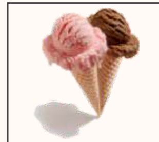
*Punjabi Hut Recommendations

ਕੁਲਫੀ ਮਲਾਈ ਪੰਜਾਬੀ ਲਸੀ ਮੈਂਗੋ ਲਸੀ ਸਾਈਡ ਡਰਿੰਕਸ ਜੂਸ ਟੀ ਕਾਫੀ